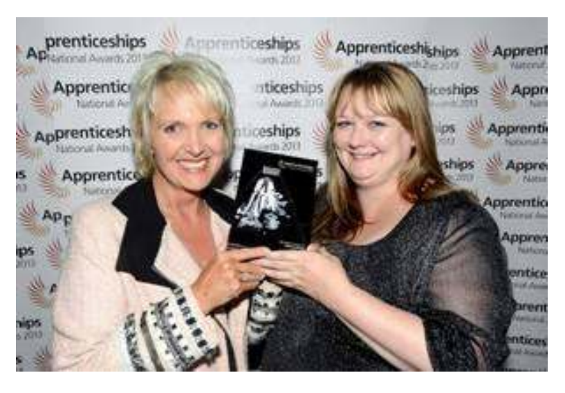
Elements Lifestyle - Winners of South Central Small Employer of the Year 2013 at the National Apprenticeship Awards.